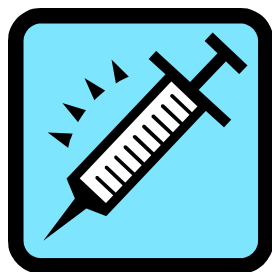
Do NOT handle medical waste!

near intersections and drive-ways. Please car-pool to your destination to limit the number of parked vehicles.